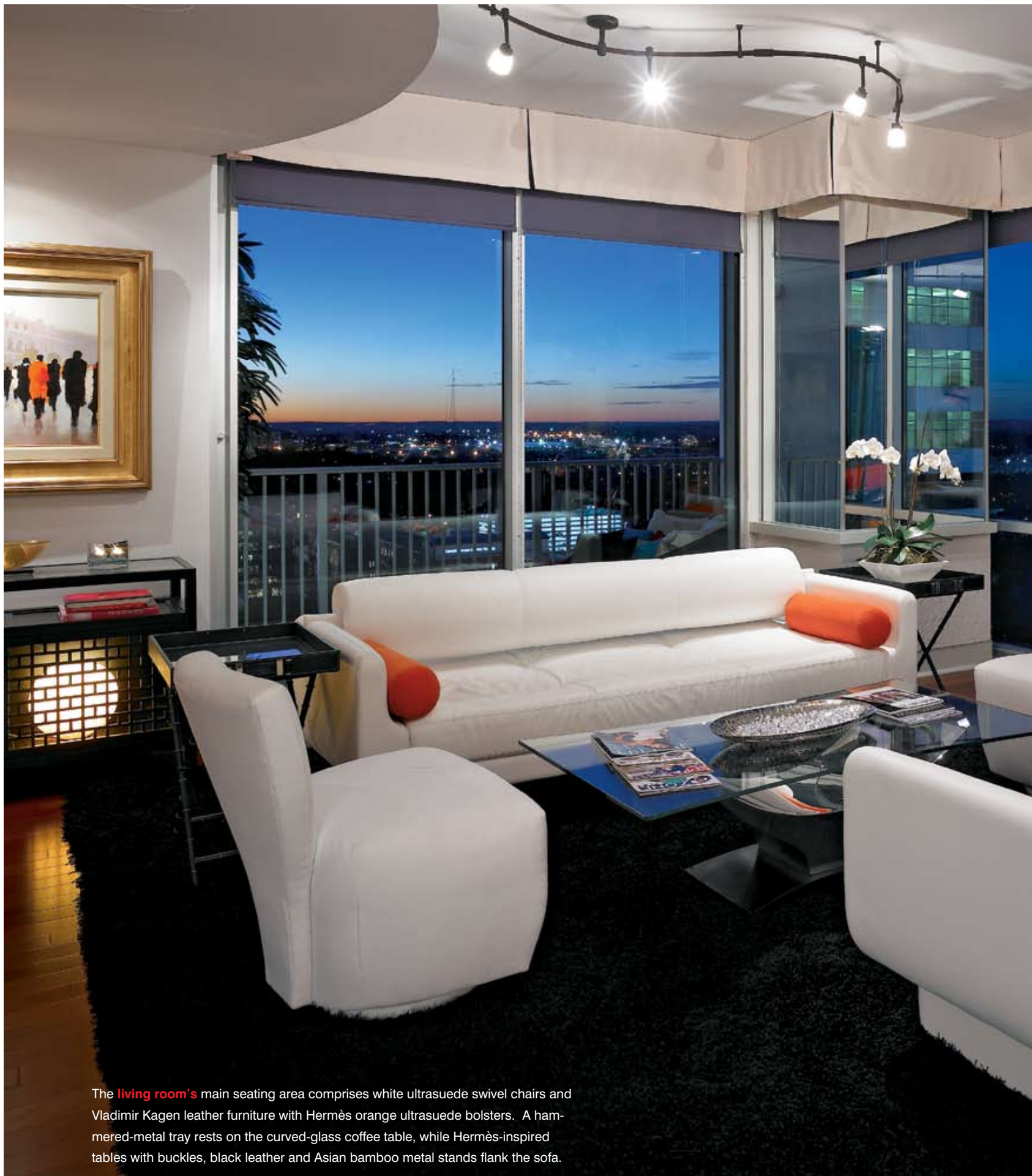
The living room's main seating area comprises white ultrasuede swivel chairs and Vladimir Kagen leather furniture with Hermès orange ultrasuede bolsters. A hammered-metal tray rests on the curved-glass coffee table, while Hermès-inspired tables with buckles, black leather and Asian bamboo metal stands flank the sofa.