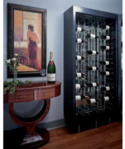
A modern take on a wine cellar includes a bottle rack from CellarMaker and a mahogany table with a beautiful wood grain from Horizon Home.