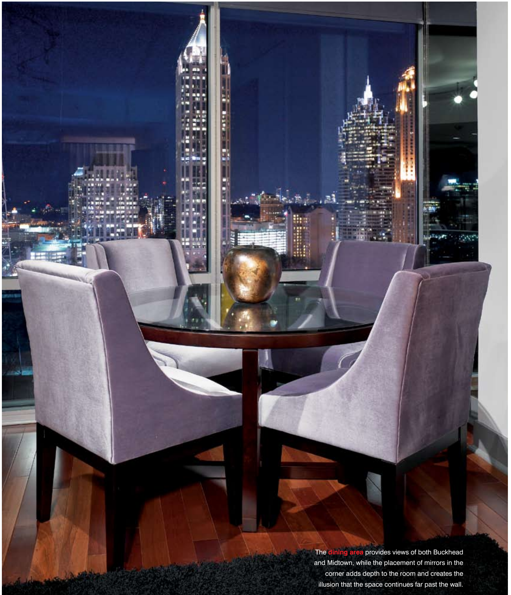
The dining area provides views of both Buckhead and Midtown, while the placement of mirrors in the corner adds depth to the room and creates the illusion that the space continues far past the wall.