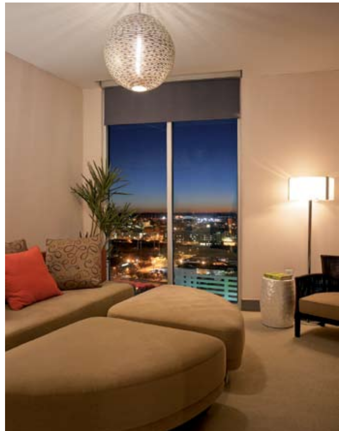
The walls of the media room are upholstered in soundproof acoustic material, so movie-theater volume levels won't disturb the rest of the building. Cleverly designed seating from Arte2 provides an array of seating options and converts into a bed for overnight guests.