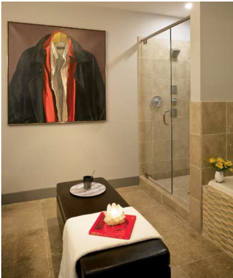
Earthy tile and stainless steel accents make up much of the bathroom , which includes triple Kohler water heads in the shower. Art by Alberto Magnani completes the area.