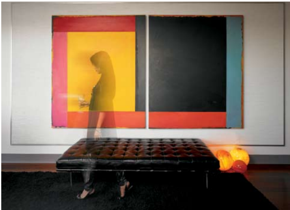
A Barcelona chaise and a floor light made from hand-blown Venini glass balls accent the grass-cloth panel, a backdrop for original art by Weinberg and Steve Litvak.

The entire living room design is a play on straight and curved lines. One of the more eye-catching elements is the natural West African driftwood that sits along the wall of windows. Its upwardly curving shape is a perfect example of how linear and contoured work together. A Horizon Home glass helix side table is a similar visual treat. Stacked blocks of glass wrap into a helix to form a base for the oval table.